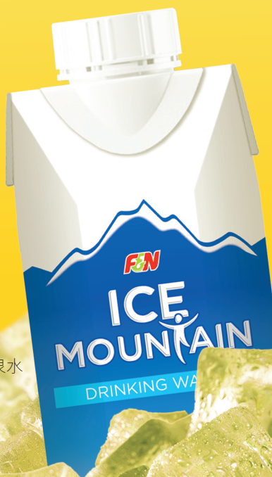
H Ice Mountain Drinking Water Ice Mountain 矿泉水

Pair Ice Mountain Drinking Water with any choice of cold drink