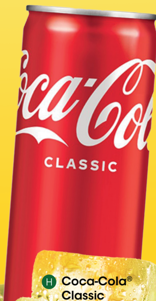
H Coca-Cola® Classic 可口可乐