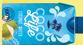
H COCO Life Coconut Water COCO Life 椰子水